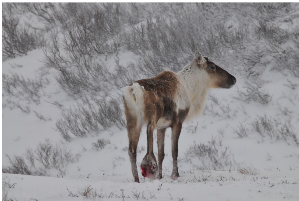
Figure 1. An adult male wild Eurasian tundra reindeer (Norway, January 2015) with digital necrobacillosis ( slubbo in North Sámi). The distal part of the right hind leg was extremely swollen and was bleeding. The condition was very painful, and the animal only reluctantly used the hindleg. The bull was shot for animal welfare reasons, and pathological findings (Norwegian Veterinary Institute) confirmed the diagnosis.

However, digital necrobacillosis (which, in some early descriptions, is often referred to as “reindeer foot disease”/“reindeer foot rot”) has long been a well-known and feared disease in semi-domesticated reindeer, especially in the 18th and 19th centuries [40–42]. Large disease outbreaks of digital necrobacillosis were often associated with the crowding of animals on wet and muddy ground contaminated with feces. Historically, the gathering of reindeer for milking was a practice that promoted digital necrobacillosis [43]. While the digital form of necrobacillosis practically vanished from the semi-domesticated reindeer in Fennoscandia after the termination of milking, as well as after the switch to larger herds and to extensive herding, the oral form of the disease has been increasingly appearing, associated with new practices of supplementary feeding [34,44].