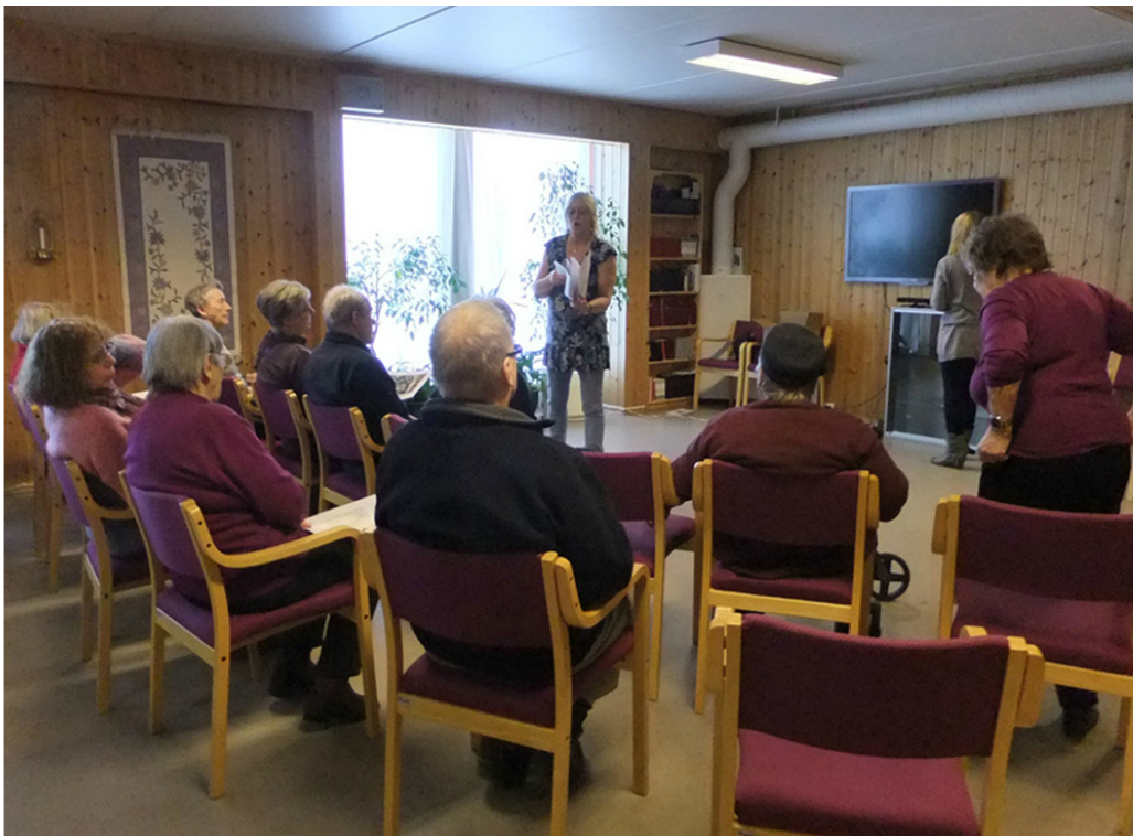
Figure 3. Seated in front of the screen ready to play.

Many changes occurred to the developed exergames through the 3 years of the GameUp project. We briefly describe the ones that can be generalized to other games in Figure 5.